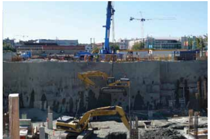
Kansen Crane Service lifting a Cat 345 excavator out of an excavation site in downtown Vancouver for Bel Pacific.