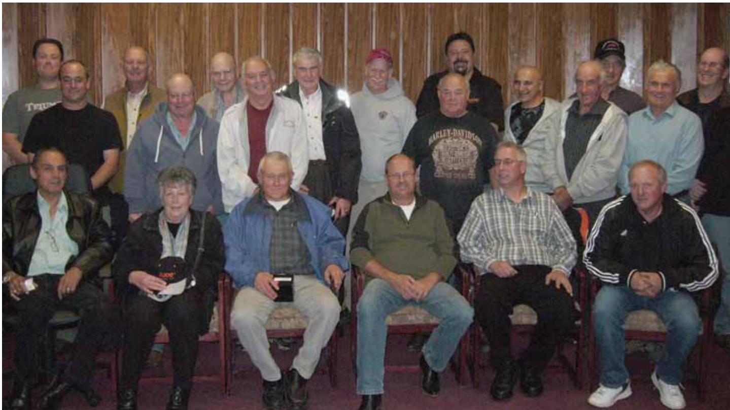
District 4 meeting in October.